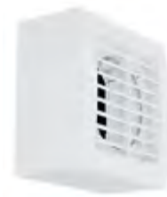
Window Kit with External Fixed Grille 410-WKG100