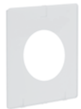
Ceiling Mount Kit 410-CG100

A full range of ancillaries and ducting are available for this product. Please contact us for more details.